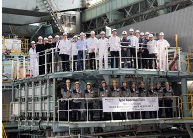
Attendees at the Triton TAT

MAN Energy Solutions enables its customers to achieve sustainable value creation in the transition towards a carbon neutral future. Addressing tomorrow's challenges within the marine, energy and industrial sectors, we improve efficiency and performance at a systemic level. Leading the way in advanced engineering for more than 250 years, we provide a unique portfolio of technologies. Headquartered in Germany, MAN Energy Solutions employs some 14,000 people at over 120 sites globally. Our after-sales brand, MAN PrimeServ, offers a vast network of service centres to our customers all over the world.